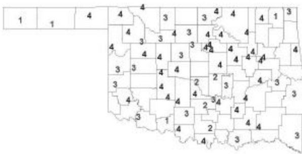
Figure 2. The categorized 60 cm daily-averaged values of matric potential from September 24, 2001. Physical descriptions of the categories are given in Table 1.

A statewide snapshot of current soil moisture conditions is available to users as well (see Figure 2). MP is categorized as “dry”, “limited”, “adequate”, or “moist/wet” (detailed in Table 1) and displayed on a state map, station-by-station. Categorized MP data is also available in an historical archive, and gives the user the ability to quickly view past soil moisture conditions. This tool provides an expedient view of soil moisture to the policy-making and agricultural communities.