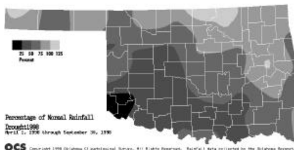
Figure 2. Percentage of normal rainfall, April-September 1998.

moisture sensors were installed at about 50 Mesonet sites by the end of the 1998 dry episode, but they played no role in drought management and mitigation decisions.