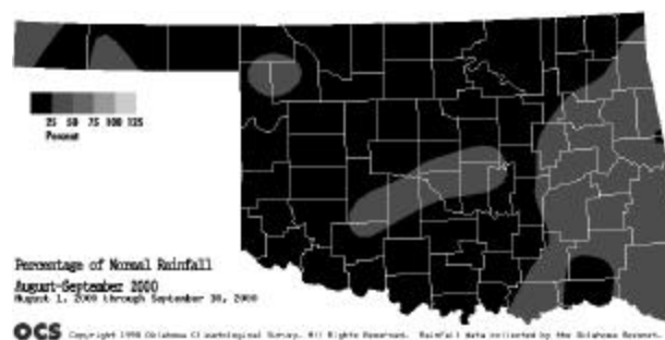
Figure 3. Percent of normal rainfall, August-September 2000.